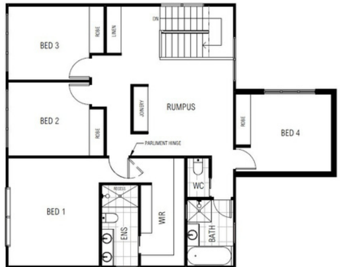
UPPER FLOOR MARK UP PLAN