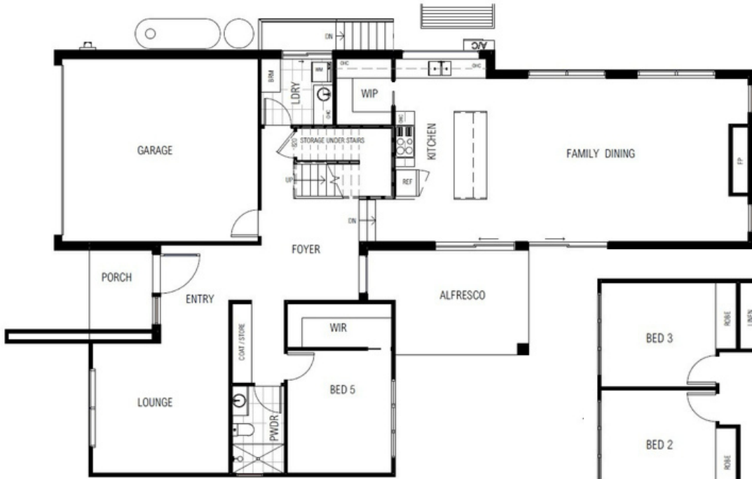
LOWER FLOOR MARK UP PLAN

SITE AREA: 540 m 2 BUILT AREA: 311.83 m 2 ALFRESCO: 14.38 m 2 ENTRANCE PORCH: 5.31 m 2 FOYER: 23.35 m 2